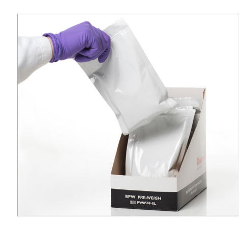
Pre-Weigh DCMs: supplied in shelf-ready boxes

*Based on an in-house study carried out under laboratory conditions **Calculated on a laboratory operating 52 weeks a year, five days a week, eight hours a day